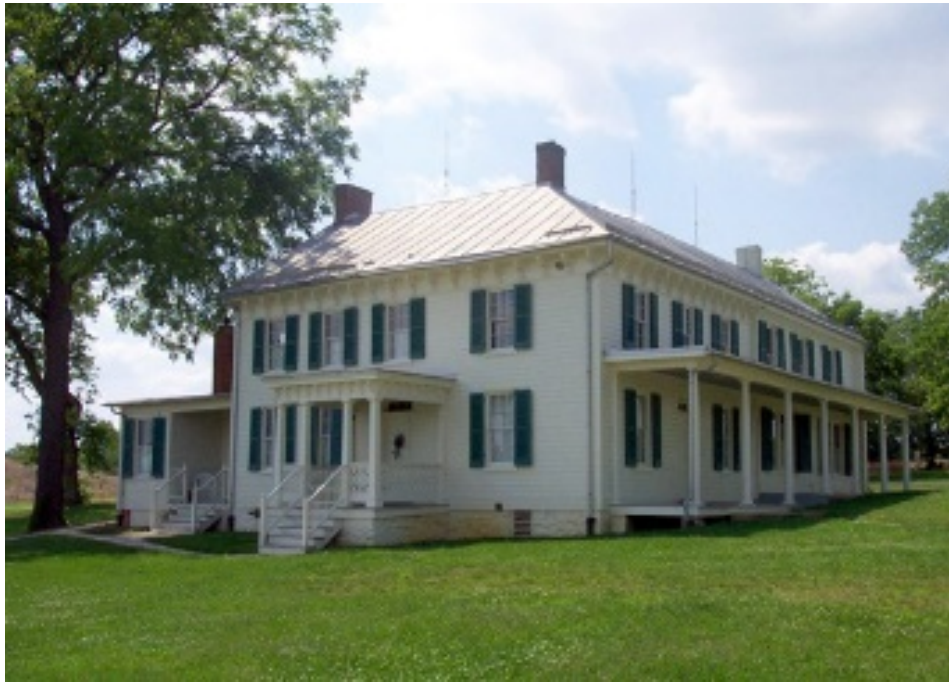
Mumma Farm House, National Park Service (NPS)