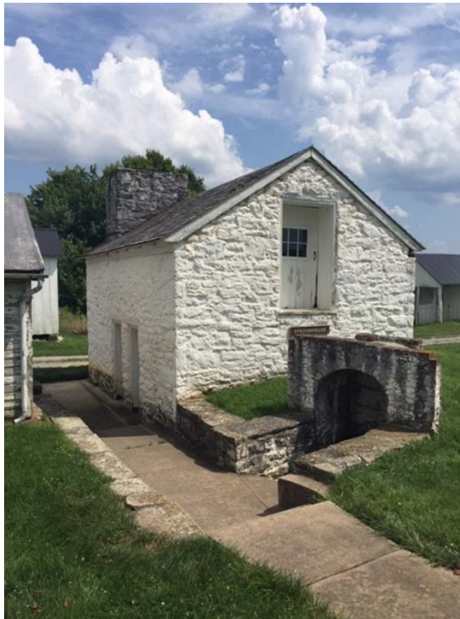
Mumma smokehouse with door on upper level to former slave quarters.