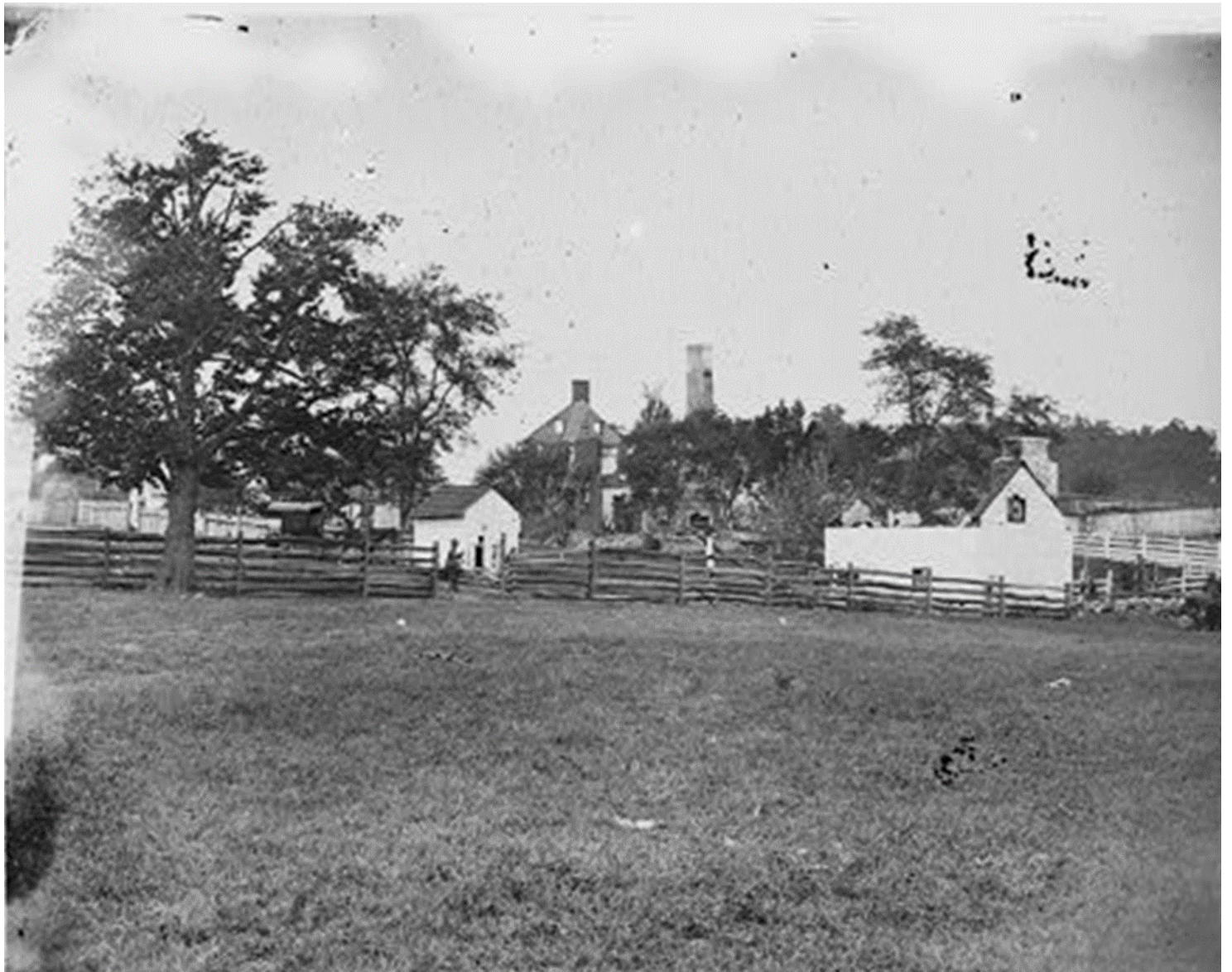
Antietam, Maryland. "Ruins of Mumma's house on the battlefield." Sept. 1862.

Samuel Mumma House. National Register File No. 66000038